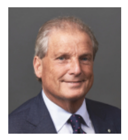
Director since: April 2015 Age: 63 Independent Committee Memberships: