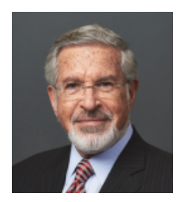
Director since: May 2015 Age: 73 Independent Committee Memberships: